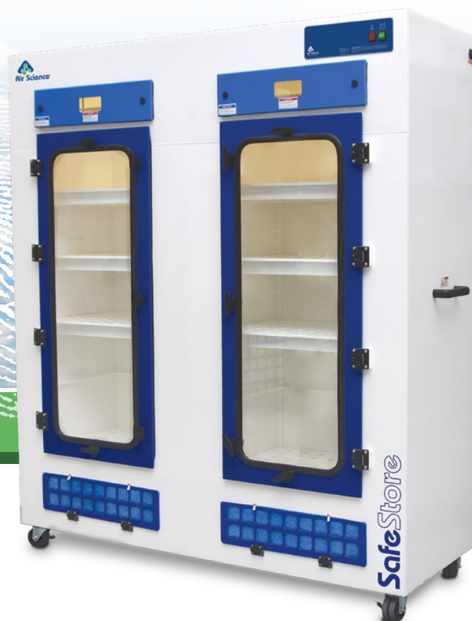
— Safestore™ 64T

Provides Environmentally Safe Processing and Storage of Evidence