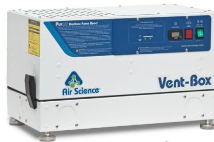
▶ Vent-Box 60