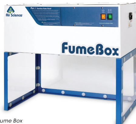
▶ Fume Box AP60V