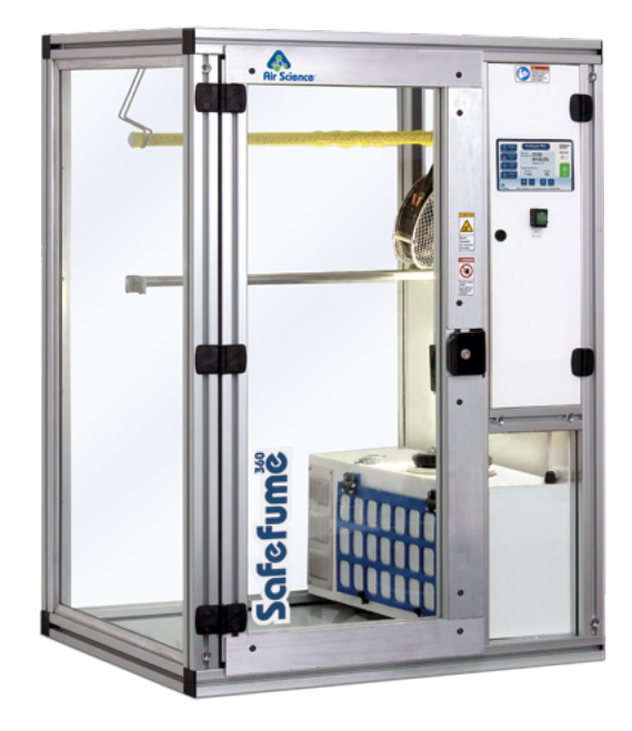
Safefume 360 ARV-24

Self-Testing. (select models) Electronic airflow monitoring assures continuous safety. An electronic gas sensor monitors carbon filter performance.