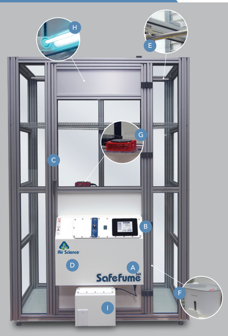
Safefume 360 ARV-601