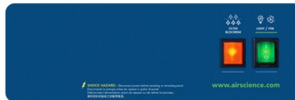
Basic Control Panel

The basic control panel is standard and includes an On/Off switch and Filter Blockage alarm.