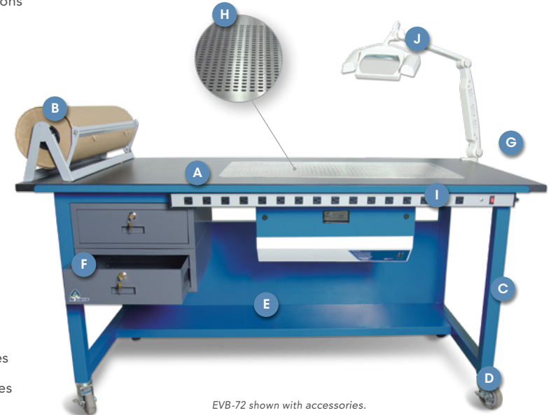
EVB-72 shown with accessories.