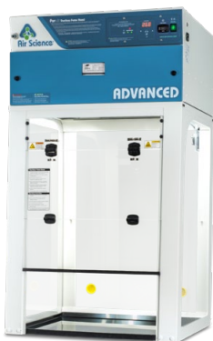
Model P5-24-XT (left); Model P10-XT (right).