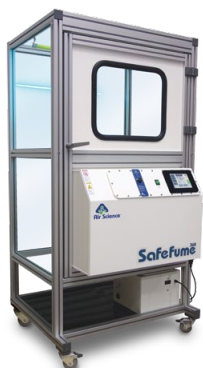
Model ARV-33T . Chamber shown with optional UV Lamp and UPS (power supply).