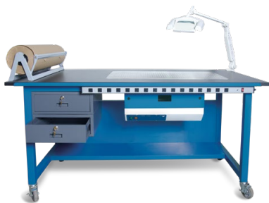
Model EVB-72 shown with optional airflow pod, magnifying lamp and power package outlet strip.

airscience.com/ductless-down-flow-workstations