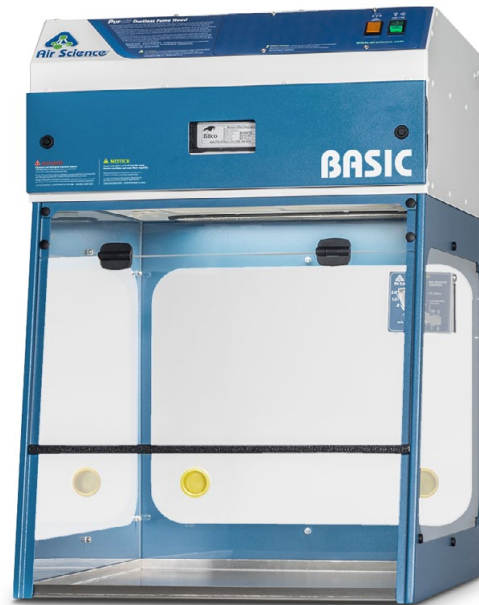
Purair ® P5-24-XT