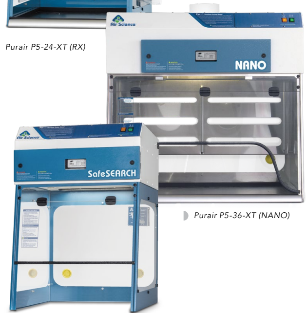
Purair P5-36-XT (NANO)