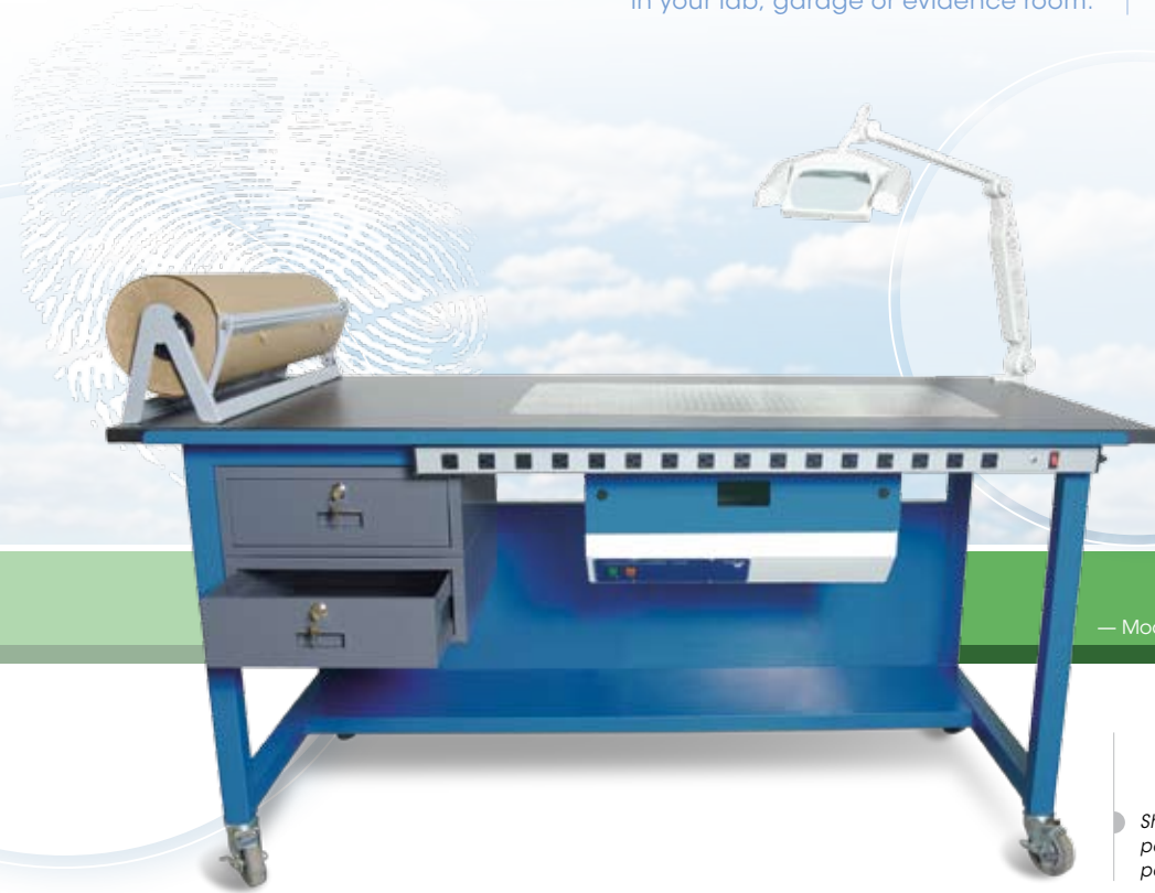
— Model EVB-72

Shown with optional airflow pod, magnifying lamp and power package outlet strip.